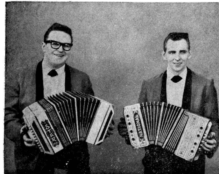
THE VERSATILE VERSATONES