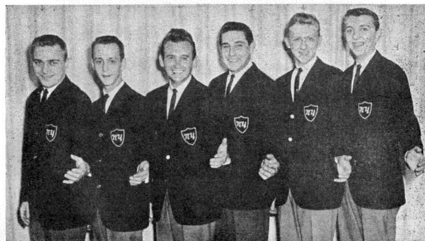
THE NEW YORKERS