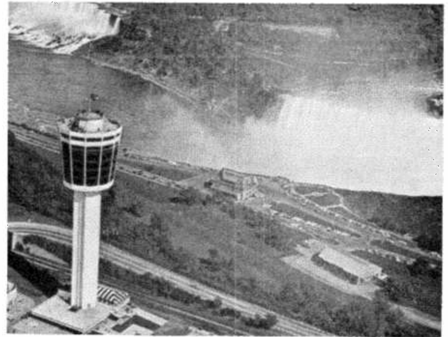
THE SEAGRAM TOWER NIAGARA FALLS, CANADA

MAIL TO: POLKA GUIDE 1740 W. 47th ST. CHICAGO, ILL. 60609