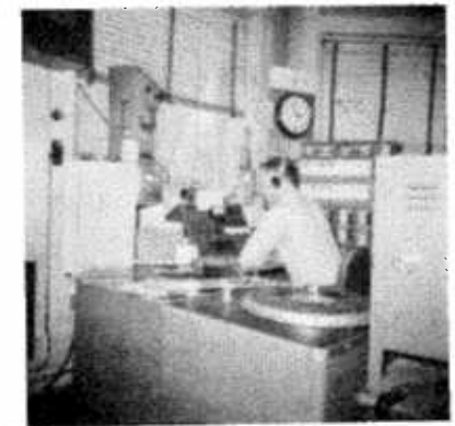
"THE LOU BOND SHOW"

Grand Rapids Michigan WGRD Sun 1:30-4 p.m.